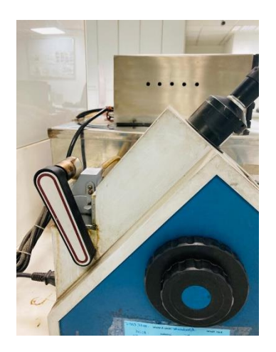
Fig.2 ABBE RFRACTOMETER

When finally the materials are tested, these are sent to the process area for the manufacturing process.