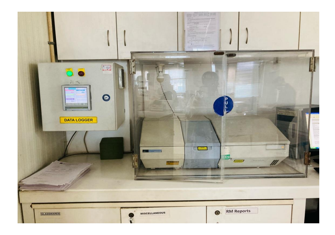
Fig.1 FTIR INSTRUMENT

So from here small amount of each raw material comes to the quality laboratory for testing. All the samples get tested by either FTIR or ABBE. The FTIR instrument is to check the Infrared Radiation and the ABBE Refractometer is to check the Refractive Index.