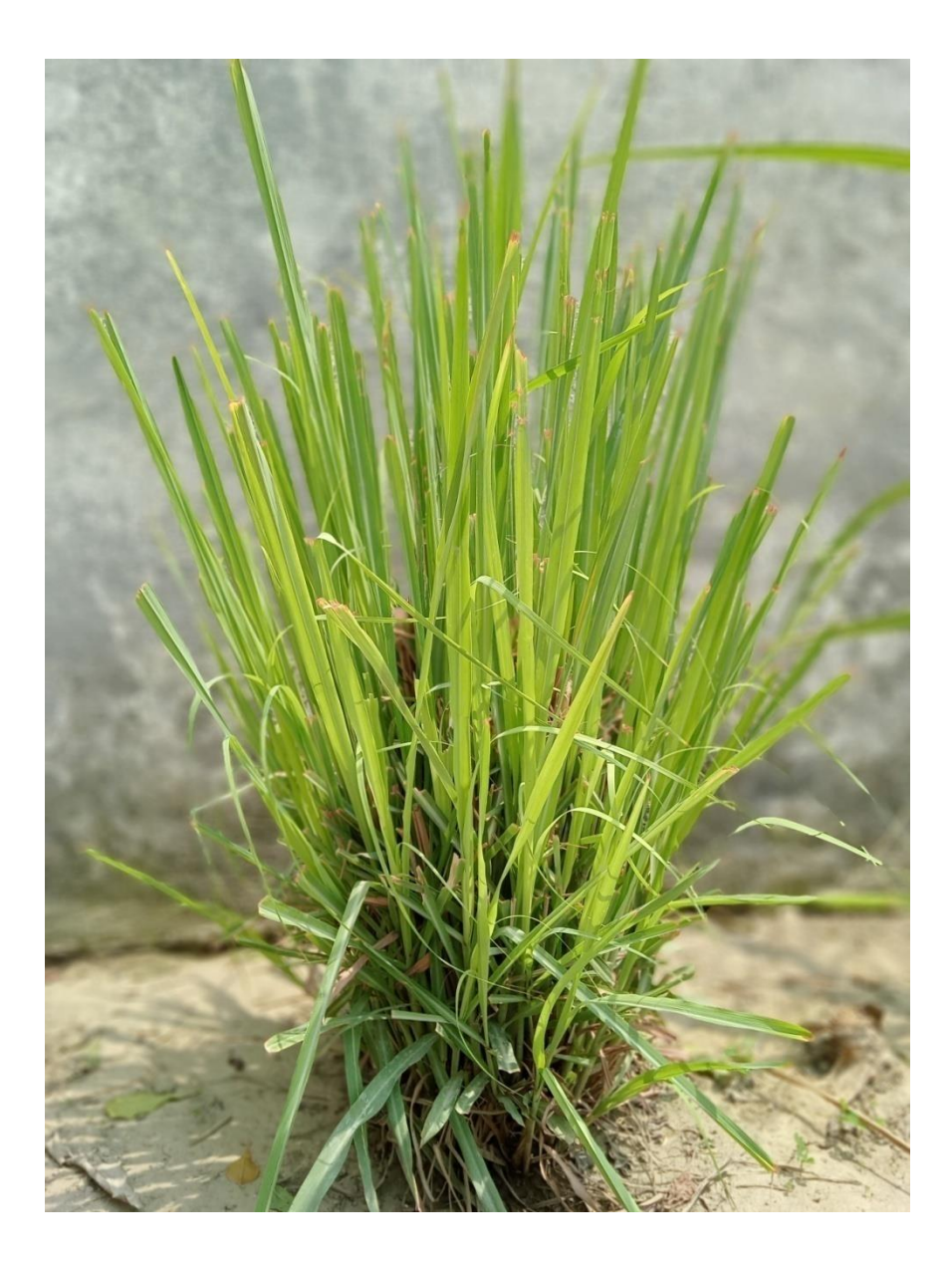
Figure 1: Lemon grass (Cymbopogon citratus)