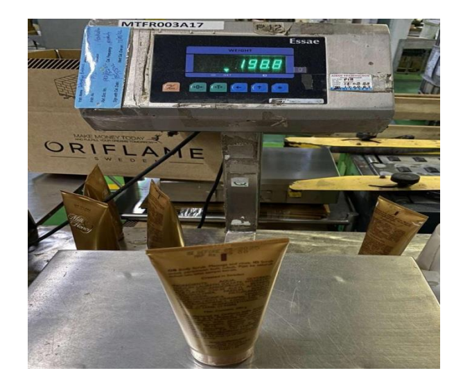
Fig. 18: Checking weight during finish good inspection

• Vacuum Leakage ( Pump & Cap Products ) - The vacuum leakage test of products is done through vacuum oven.