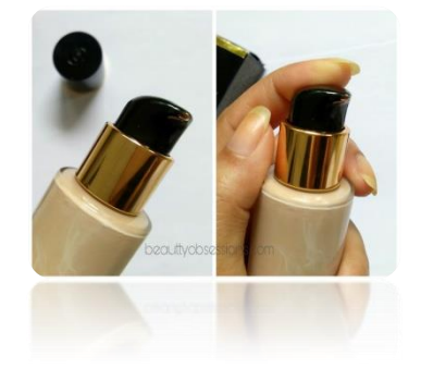
Fig. 15: Cap & Pump