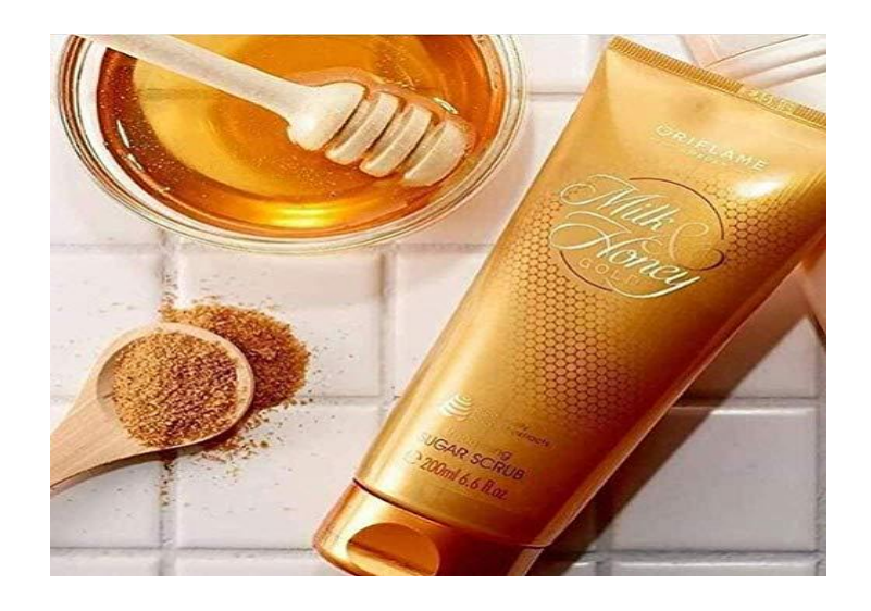
Fig 3. Honey Sugar Scrub

Sugar helps in polishing the skin act as natural exfoliant. Honey clears away dirt and oil by opening the pores.