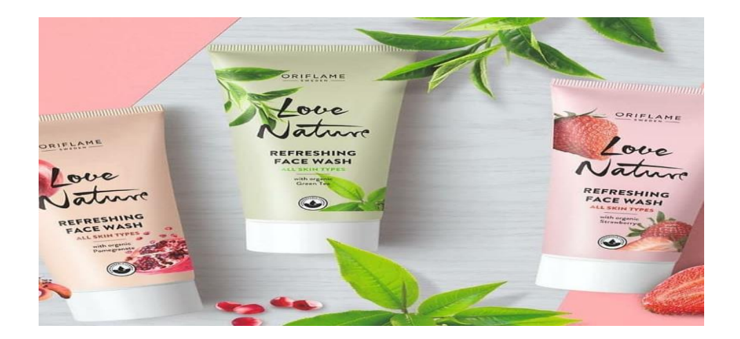
Fig 4. Face Wash

Helps in removing impurities, reduce appearance of pores and help in balancing skin hydration level.