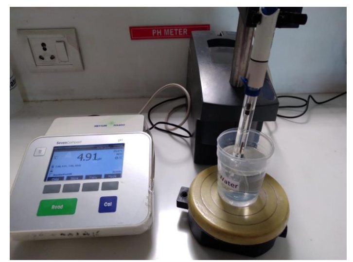
Fig. 9: Working of pH Meter