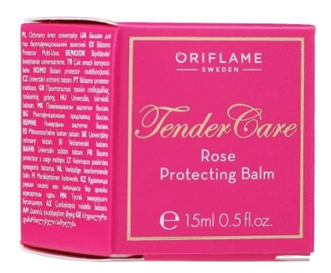
Fig. 17: Unit Carton