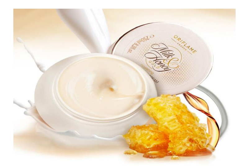
Fig 5. Honey Body Cream

KEY INGREDIENTS: Organically source extracts of milk and honey.