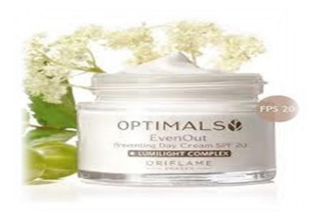
Fig. 16: Glass Containers