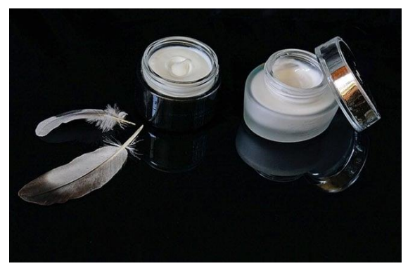
Fig. 10: Determination of Total Fatty Matter

The commonly used reagents in this method are: dil. HCl, ether, methyl orange (use as an indicator) and sodium sulphate.