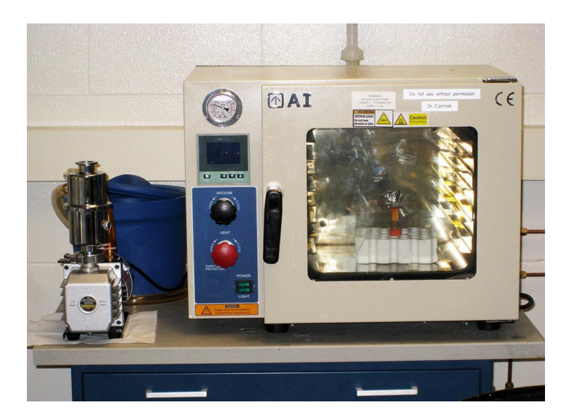
Fig. 19: Vacuum Oven for leakage testing

For testing place the sample inside the oven with proper closing the cap. Once oven vacuum reached 625mm Hg, closed the vacuum knob. Then, allow to hold the specified vacuum for 10 - 15 minutes. Release the vacuum through pressure valve to zero reading. At last evaluate the sample for leakage if any.