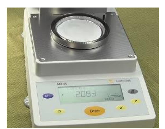
Fig. 11: Weighing of sample to determine Loss on drying