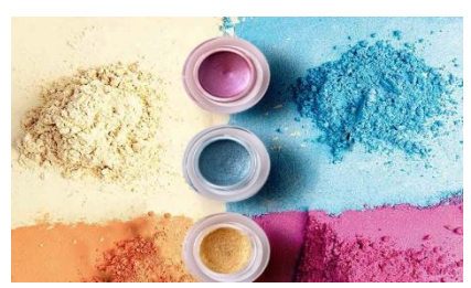
Fig. 22: Colour Testing

The colors of the products are required to comply with the standard to avoid color variation in any batch of the same product. The organoliptic test method should be sufficient. This test is applicable for creams, lotions, surfactant products, gels, etc. All the samples of creams, scrub, etc. were observed to contain desired color as per standard.