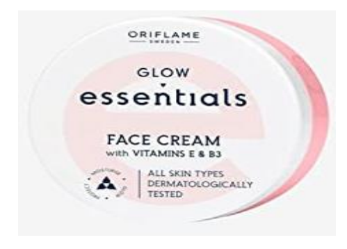
Table : 14 Label for Packaging tests