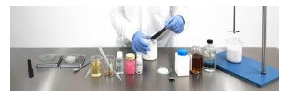
Fig 6. Chemical Analysis of different skin care products

For chemical analysis, a range of instruments are used such as: Brookfield Digital Viscometer, Pycnometer, pH meter, Weighing Balance, Glassware, Oven, etc.