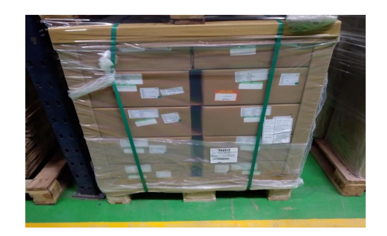
Fig. 20: Pallet

3. <u>Goods Product AQL Checks</u> : During finish goods inspection performing AQL is very important, because it is highly flexible, it allows you to customize your quality tolerance for your product, according to the formula of under root n + 1. The Acceptable Quality Limit tells you about how many defective samples / components are considered acceptable during random sampling quality inspections.