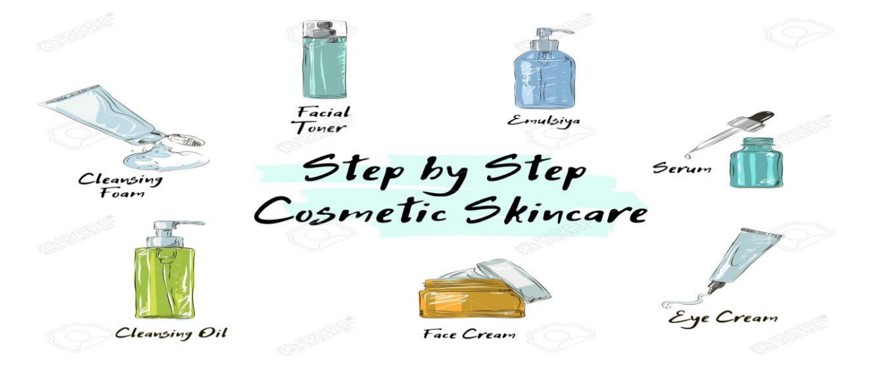
Fig 1. Various types of skin care products

Skin care products shows wide variety of products used in our daily life for example, shower gels, facial scrubs, facial masks, face wash, hand and body creams, foot cream, eye cream, toner, moisturizers, hydrating & anti-ageing creams, etc. We will discuss about each variety further in elaborated manner.