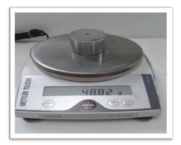
Fig. 8: Pycnometer along with weighing balance