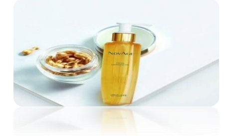
Fig. 13: Bottle and Jars