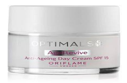
Fig 2. Anti-ageing Cream

Anti-pollution active : act as protective shield over the skin which protect from pollution.