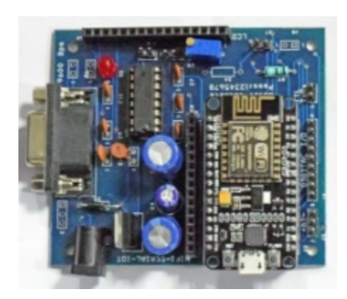
Fig.5 IoT Modem

The IoT modem permits vehicle to be detect and controlled distantly from the internet infrastructure. This IoT modem capable of communicate with microcontroller via UART communication. The data to be transfer to internet webpage using Wi-Fi network.