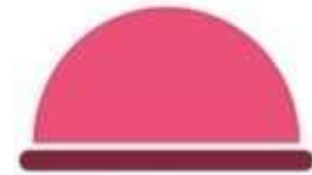
Diaphragm / cap