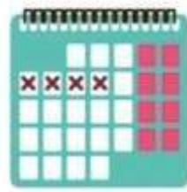
Calendar rhythm method